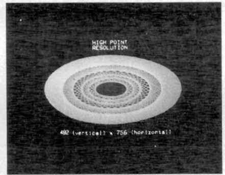
High-resolution display with alphanumerics