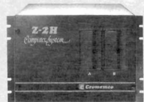
Model SDI plugs into Z-2H 11-megabyte hard disk computer or any Cromemco computer

To achieve the high-quality display, a separate output signal is produced for each of the three component colors (red, green, blue). This yields a sharper image than is possible using an NTSC-composite video signal and color TV set. Full image quality is readily realized with our high-quality RGB Monitor or any conventional red/green/blue monitor common in TV work.